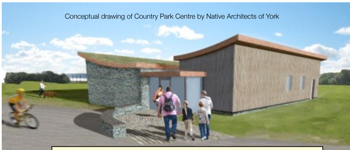
Conceptual drawing of Country Park Centre by Native Architects of York

As the project progresses, we are working closely in partnership with others, including Hull University, Scarborough Campus, to educate and promote our living and built heritage, culture land and seascape for the benefit of future generations. Our public consultation will continue and we have already been inundated with support and numerous positive suggestions which will be incorporated into the building and landscaping. This is a community centered project, we welcome your suggestions and particularly any offers of help. Please contact us on the contact page of our website www.discoverfiley.org.uk or there is someone to be found most weekdays at our office in the ground floor community office in the Evron Centre.