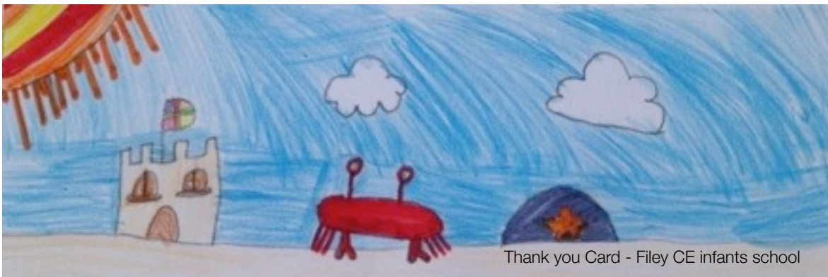
Thank you Card - Filey CE infants school